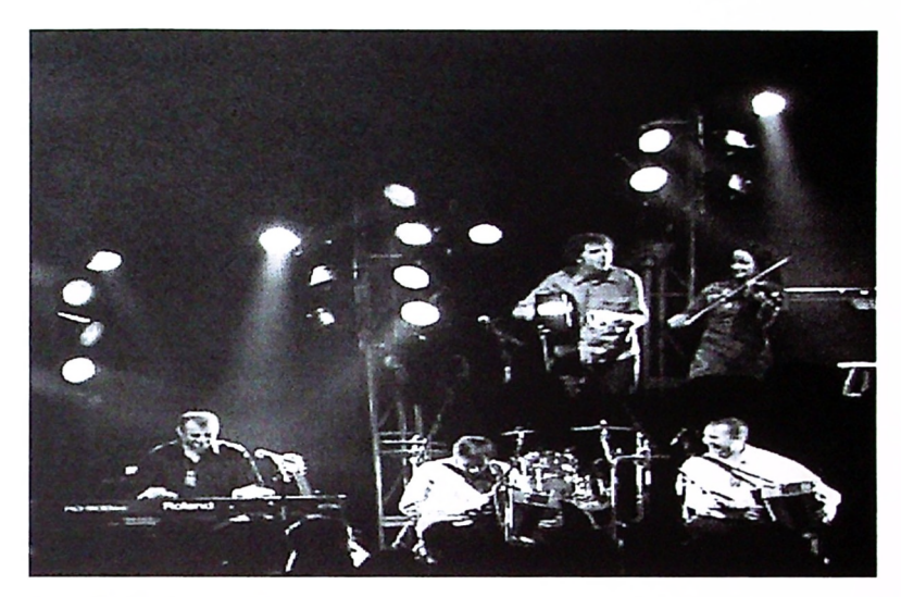
BEOGA in Concert

Saturday, February 28th, 8 pm Berger Performing Art Center.