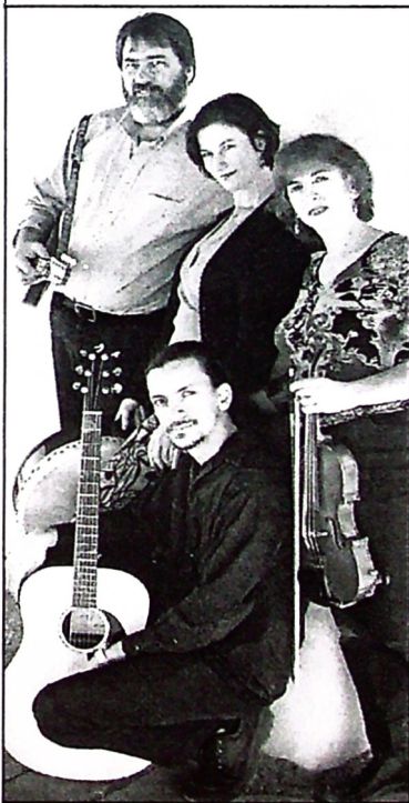
Round the House

We are replacing quite a few of the dance floor panels so that the dance floor will be in excellent condition.